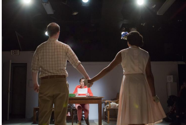
Loving and Loving

Radical Evolution is a multiethnic producing collective committed to creating artistic events that seek to understand the complexities of the mixed-identity existence in the 21st Century. We believe that visibility and representation for the fastest growing demographic in our nation is crucial to live performance. Our ensemble-based approach to creating aesthetically and formally rigorous events with people from a variety of backgrounds works to break down barriers between both cultures and specializations. We incorporate people from a variety of backgrounds into our creative process, with a focus on people of color, to seed the field of experimental and collaboratively created theatre with practitioners that celebrate the intersectionality of perspectives and aesthetics of the city around us. Through this approach, we work to assert a vision for cultural and social equity in our field, city, and nation.